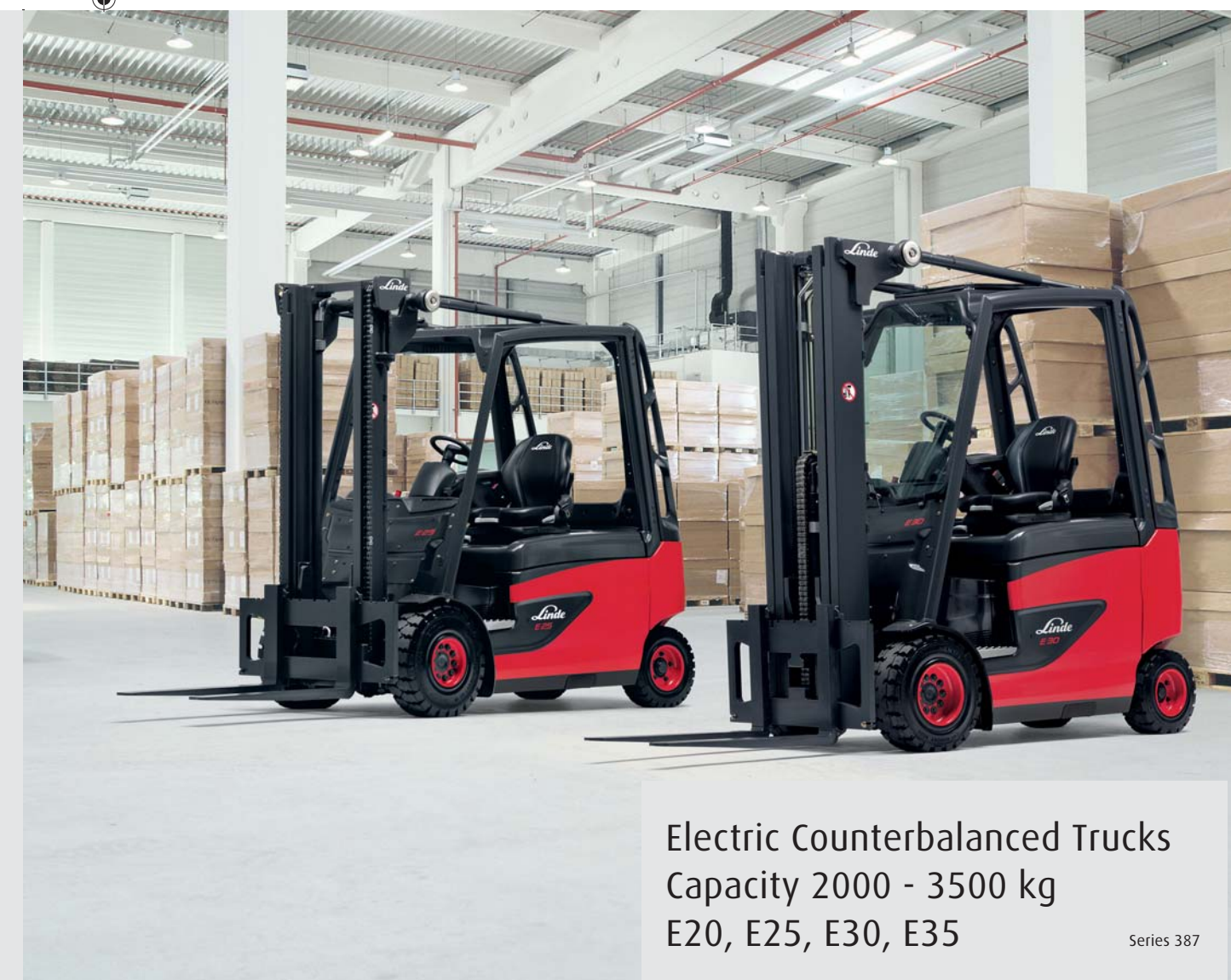
Electric Counterbalanced Trucks Capacity 2000 - 3500 kg E20, E25, E30, E35